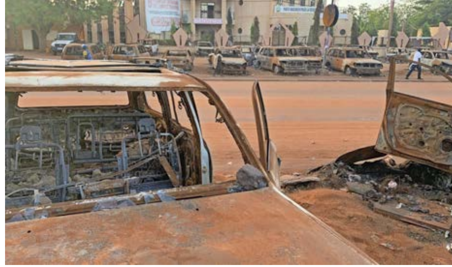
THE surge in coups in the Sahel region for the past five years is a stark reminder that Africa's challenges have far-reaching implications for global stability, says the writer.

While the UN has been instrumental in orchestrating various peace agreements, its track record reveals a