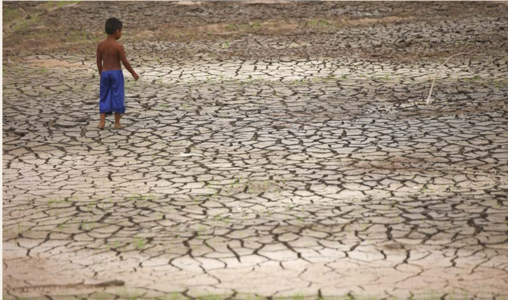
A BOY walks on a dry area of the Igarape do Taruma stream which flows into the Rio Negro River, as the water level at a major river port in Brazil's Amazon rainforest hits its lowest point in at least 121 years, in Manaus, Brazil, this week.