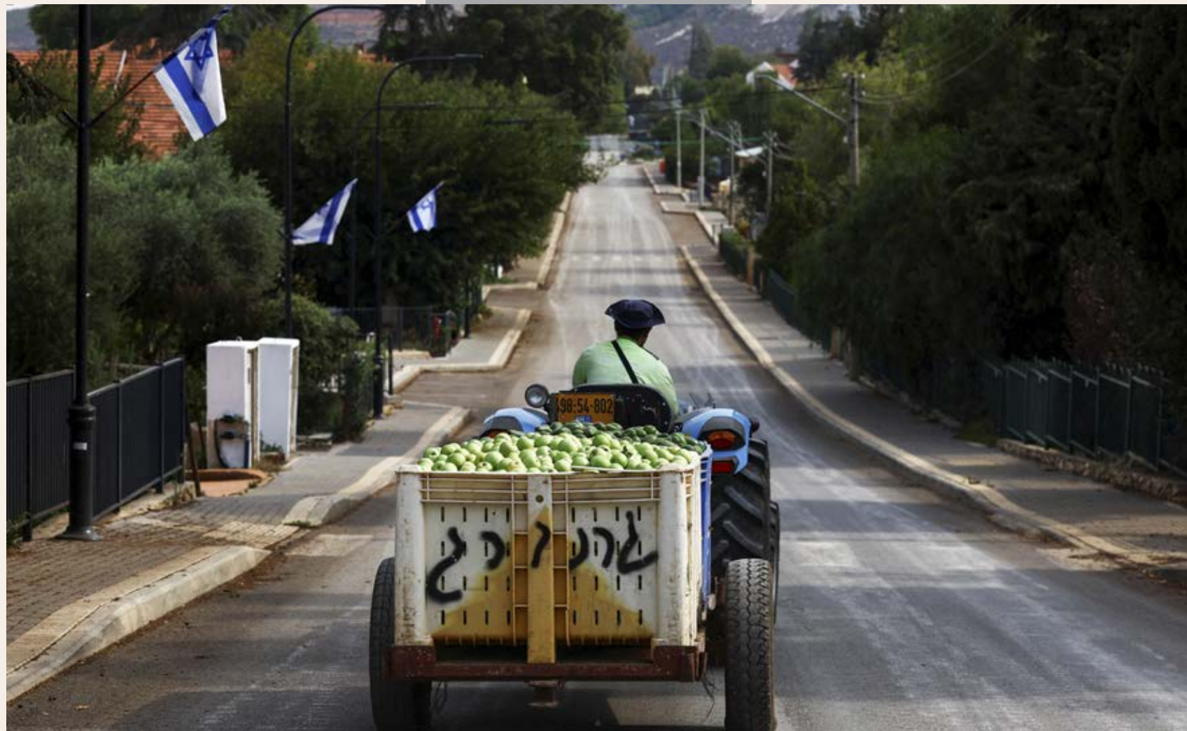
A FARMER transports apples along a road in Metula near Israel's border with Lebanon, in northern Israel, this week.